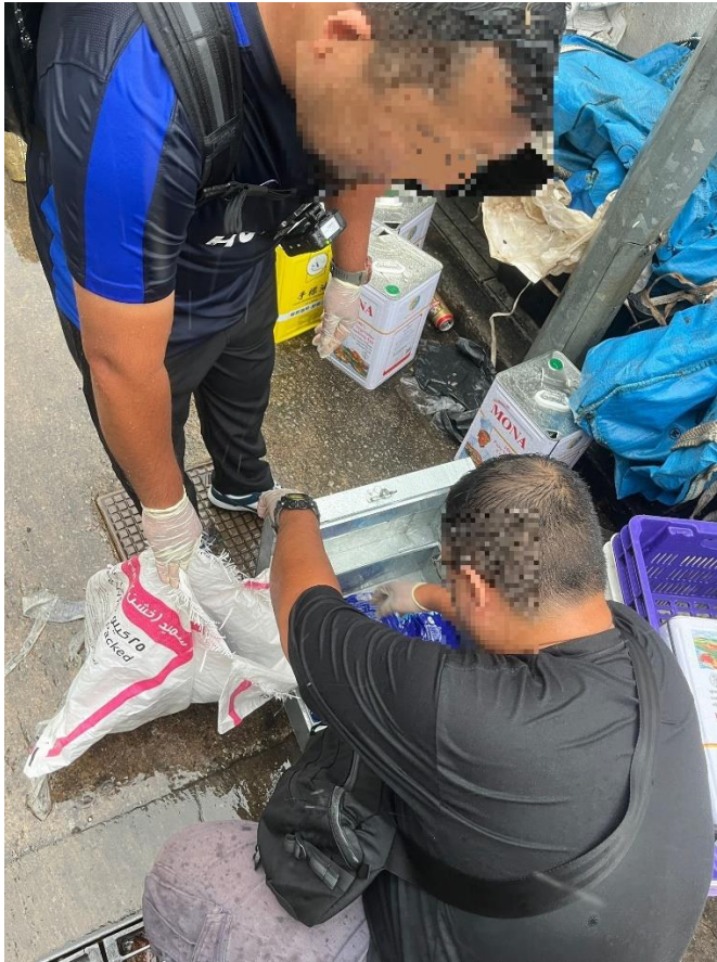
Smokeless tobacco found hidden in an electrical box