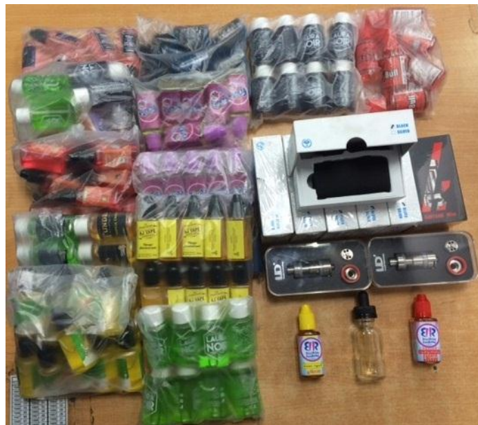
Total exhibits seized from car