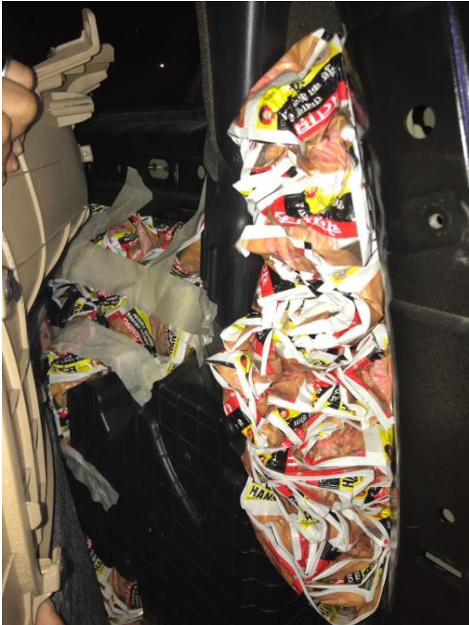
Image 7: Chewing Tobacco hidden in the side compartments of the vehicle