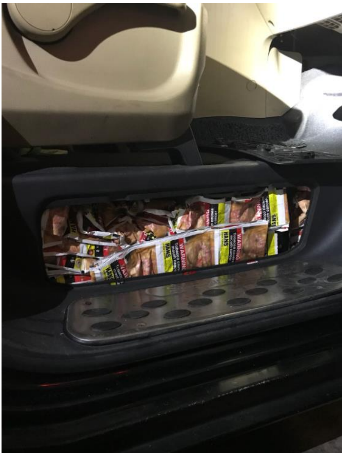
Image 5: Hans Chhap Chewing Tobacco found hidden below driver's seat