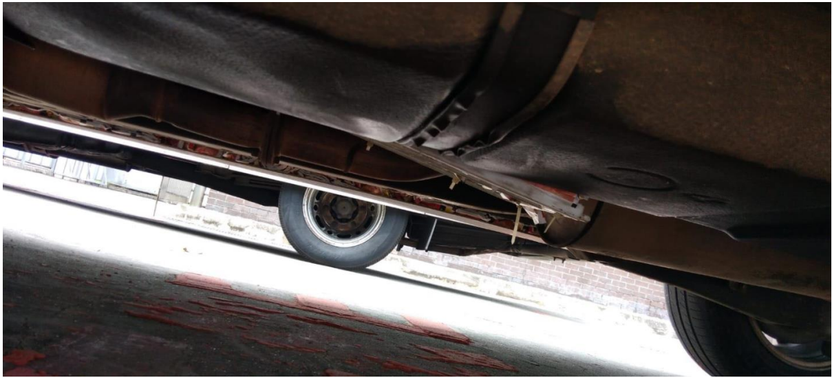
Image 8: Hans Chhap Chewing Tobacco hidden at the bottom of the vehicle