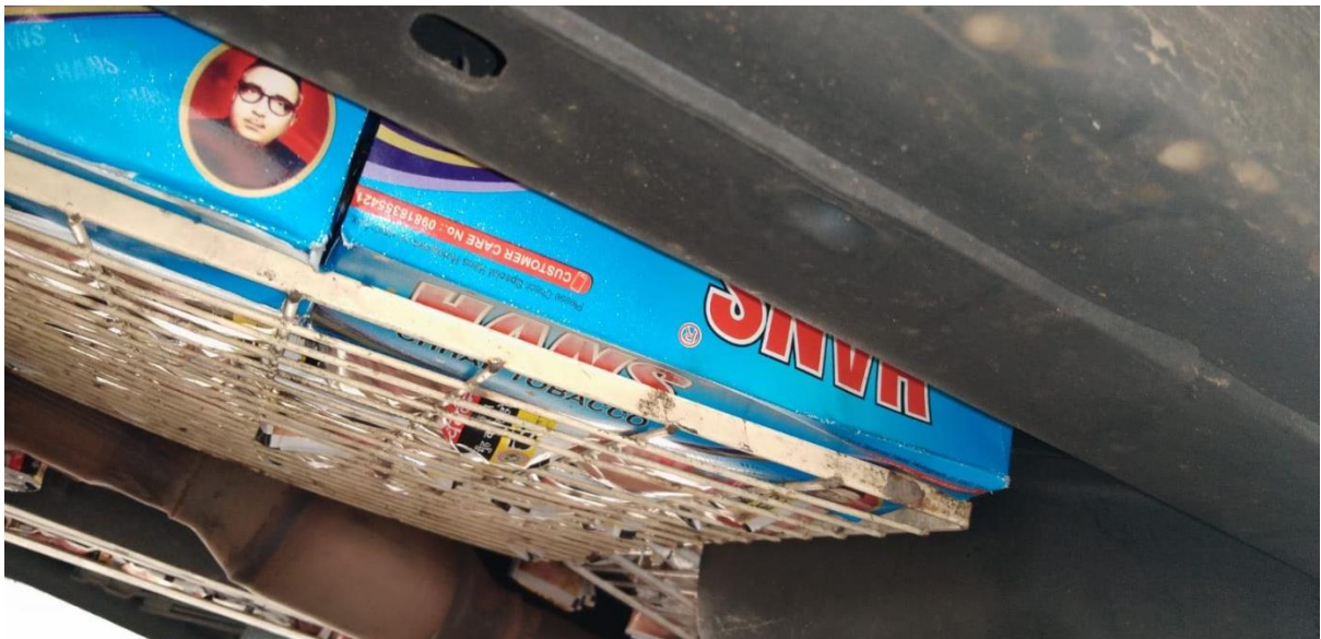
Image 9: Close-up shot of the hidden products under the vehicle