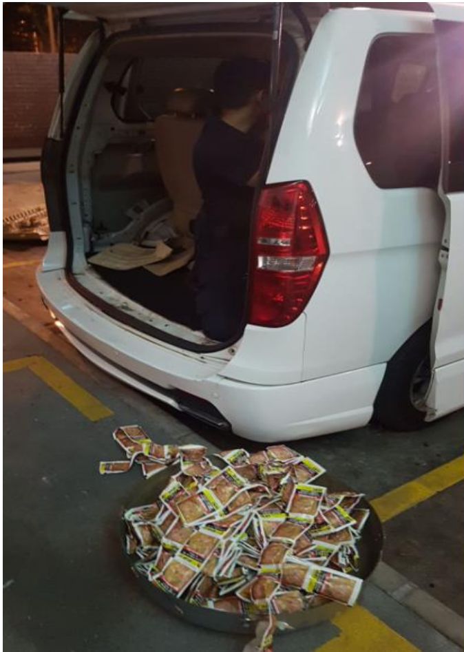
Image 4: Prohibited products retrieved from the vehicle