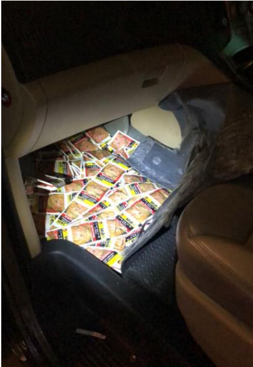
Image 2: Hans Chhap Chewing Tobacco hidden in a compartment of the vehicle