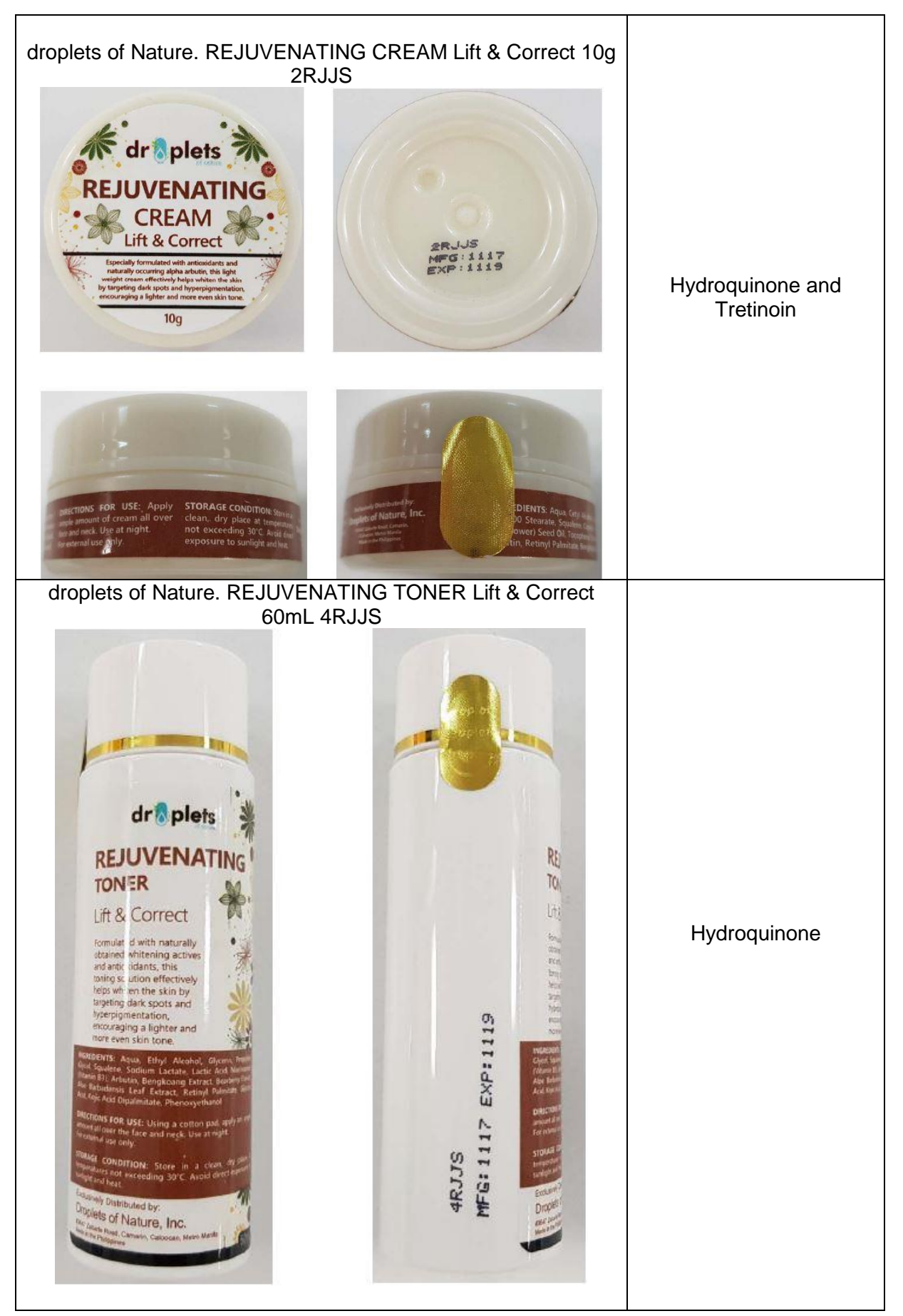
Page 7 of 14