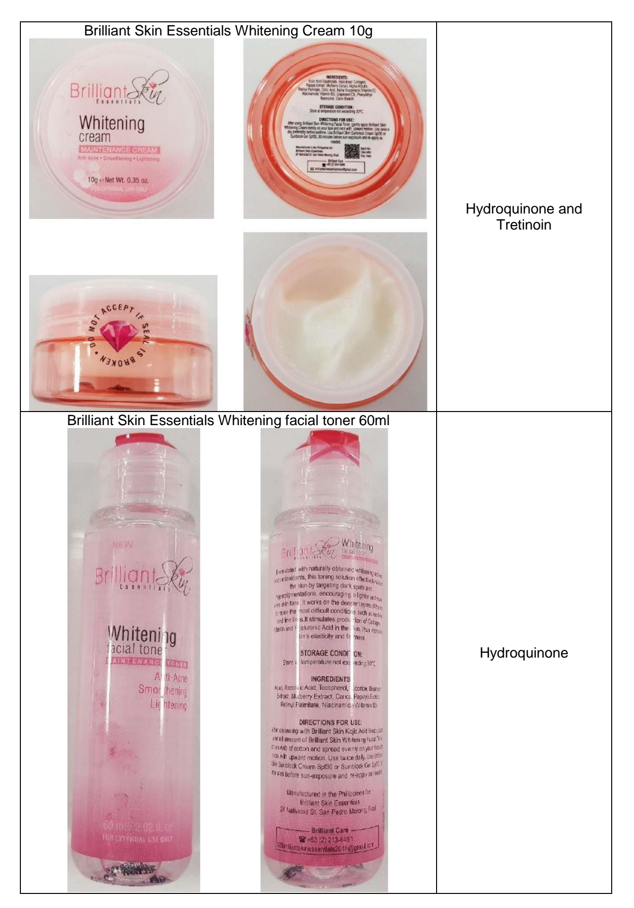
Page 6 of 14