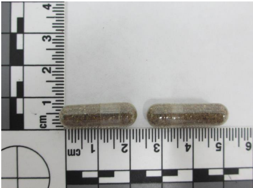
Close-up of unlabelled clear capsules with dark brown powder