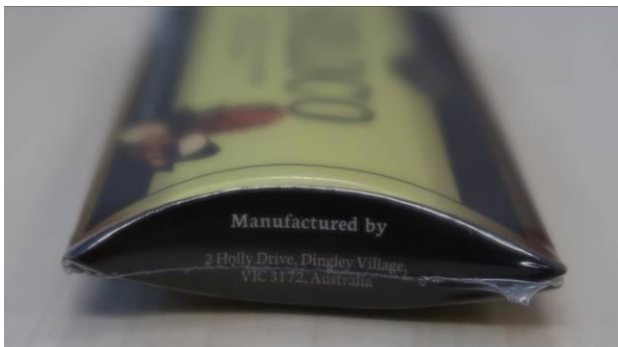
Product in individual wrapper