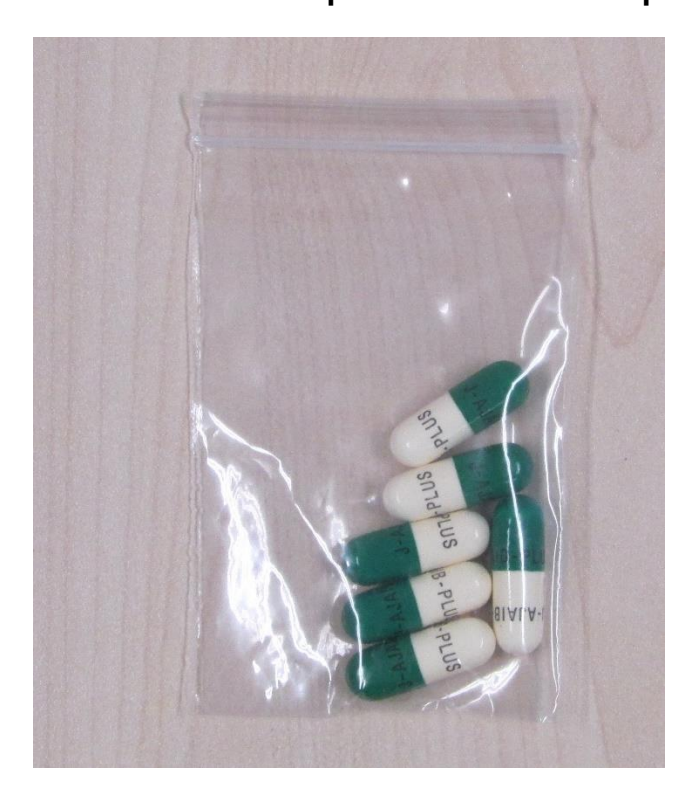
Page 4 of 7