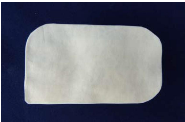
Tyvek Lid of Prodisc-C Vivo Inner Blister Package

Prodisc-C Vivo implants are packaged sterile in a double barrier setup, with an outer foil package and an inner blister package. For the impacted lot, the Tyvek lid may be missing from the inner blister package. Due to the double barrier sterile packaging, the sterility of the implants will continue to be maintained when the Tyvek lid is missing.