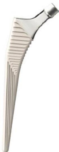
Figure 1: CORAIL Standard Offset Stem (Collarless). Image from the CORAIL® Hip System Product Rationale and Surgical Technique CA#DSEM/JRC/0616/0665(2). Issued: 06/17.