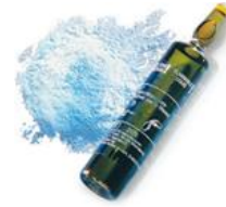
Picture 2: Refobacin Bone Cement powder and monomer ampoule

Zimmer Biomet was informed of an increase in histamine levels in the gentamicin contained in specific batches of Bone Cement and Optipac. Histamine is a normal impurity in the gentamicin manufacturing process.