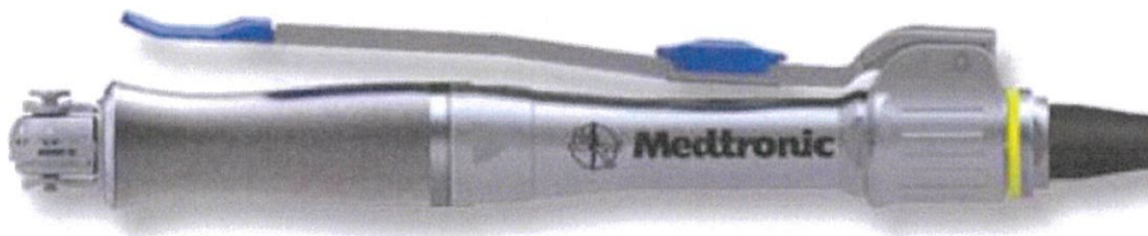
ES310 Finger Control Sagittal Saw