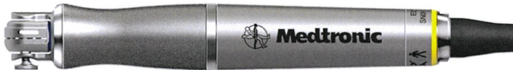
ES300 Sagittal Saw