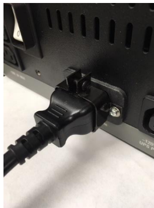
Location of power cord in rear of unit.

If the system end of the power cord (see picture below) is damaged, discontinue use of the system until a replacement cord is provided. If you experience any power issues with your unit, discontinue use of the system and contact GEHC Service.