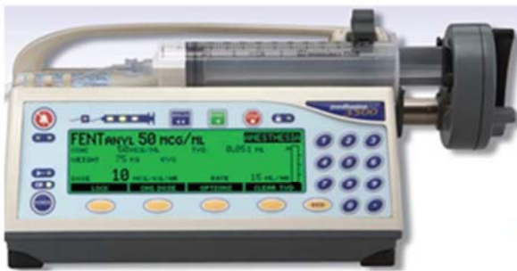
Medfusion® 3500 Series Syringe Pump

Type of Action: Recall – Correction and Removal Date: February 20, 2018 Attention: Distributors of and Clinicians who use the Medfusion® Syringe Pump Model Series 3500 and 4000 Affected Devices: The following products are potentially affected by this issue: