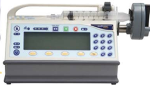
Medfusion® 4000 Series Syringe Pump