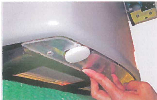
[Fig 2]: If the cover is installed, the Engineer could not grab his fingers behind the front cover of the Mobile-System