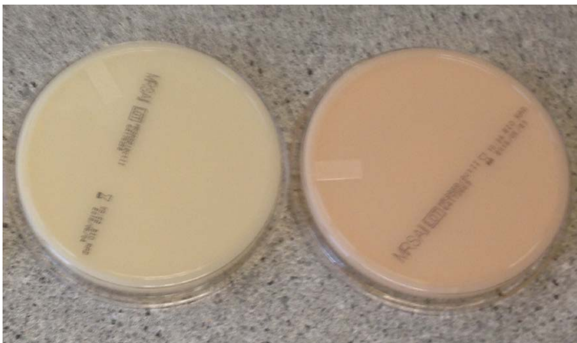
Left: agar with normal color Right: agar with abnormal color, orange-pinkish shade