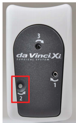
Figure 1: Stapler instrument release hole 2 “closed” with white flag present

In situations where release hole 2 is covered by a white flag (Figure 1) and is not accessible, the SRK tool must be rotated in release holes 1, 2 and 3.