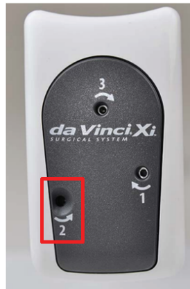
Figure 2: Stapler instrument release hole 2 “open” without white flag

To avoid breaking the tool, users should follow the manual stapler release instructions found in the EndoWrist Stapler Instruments & Accessories User Manual Addendum :