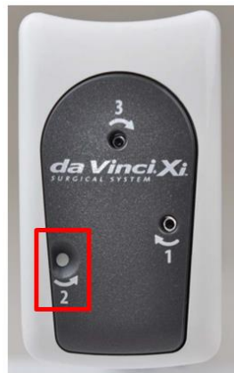
Figure 1: Stapler instrument release hole 2 “closed” with white flag present

In situations where release hole 2 is covered by a white flag (Figure 1) and is not accessible, the SRK tool must be rotated in release holes 1, 2 and 3.