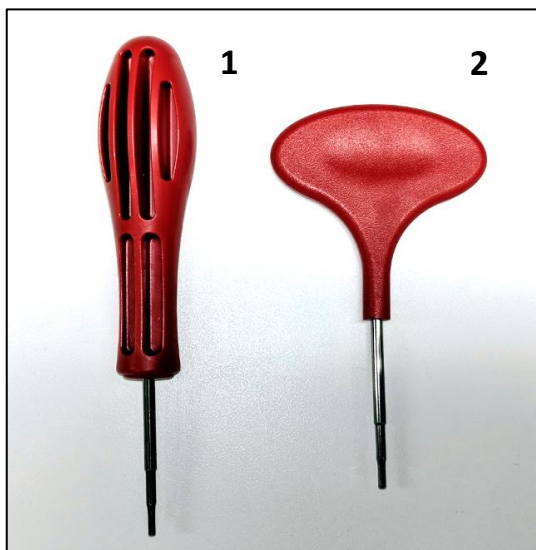
Figure 1: New SRK tool design (1) and Previous SRK tool design (2)

Intuitive Surgical will be providing you with replacement SRK tool(s) of the new design. Two new SRK tools will be provided for each da Vinci X or da Vinci Xi system. Place all new SRK tools with your system and discard any previous versions in your inventory. Additional SRK tools may be ordered via the standard ordering process.