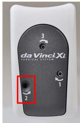
Figure 2: Stapler instrument release hole 2 “open” without white flag

To avoid breaking the tool, users should follow the manual stapler release instructions found in the EndoWrist Stapler Instruments & Accessories User Manual Addendum :