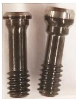
Figure 1: Incorrect screw (left, article 37893: Screw Multi-unit Abut Angled CC RP/WP) versus correct screw (right, article 37892: Clinical Screw CC RP/WP)

Packages of above mentioned abutment lots may contain an incorrect screw. The figure below shows an example of a correct and incorrect screw.