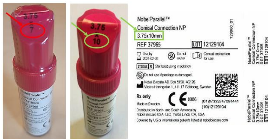
Figure 1: Incorrect top label (left), correct top label (right) and the correct side label

Issue description The top label of article 37965, lot 12129104 (NobelParallel CC NP 3.75x10mm) may incorrectly indicate an implant length of 7mm, which is shorter than the actual length of the implant (10mm). The side label does provide the correct information. Figure 1 shows examples of correctly and incorrectly labeled implant packages.