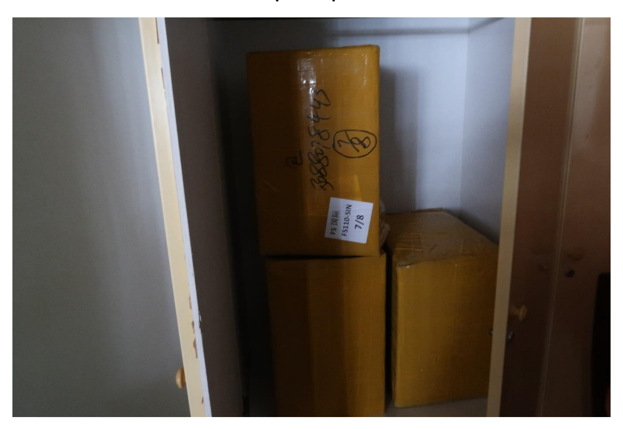
Page 4 of 5