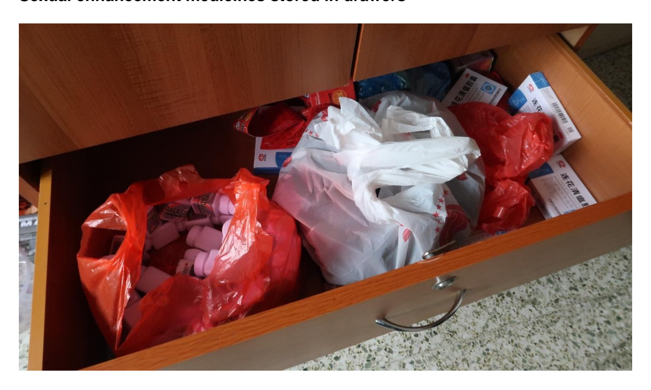
Page 3 of 5