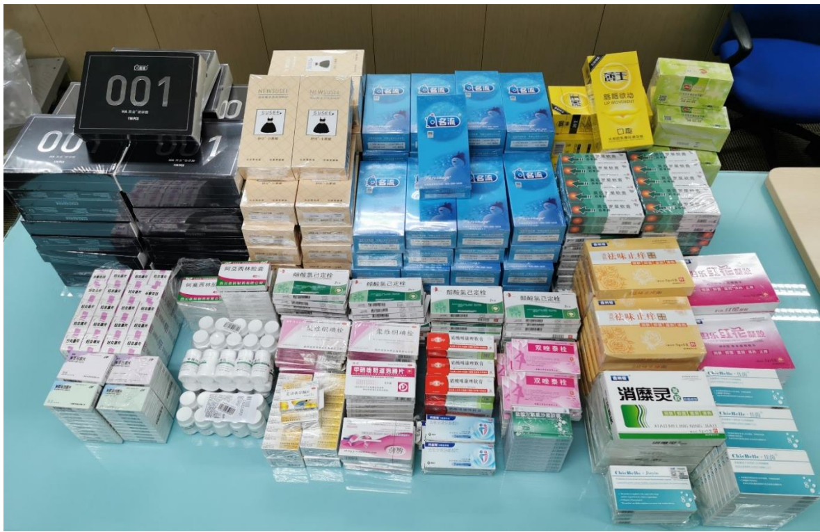
Health products stored in residential unit