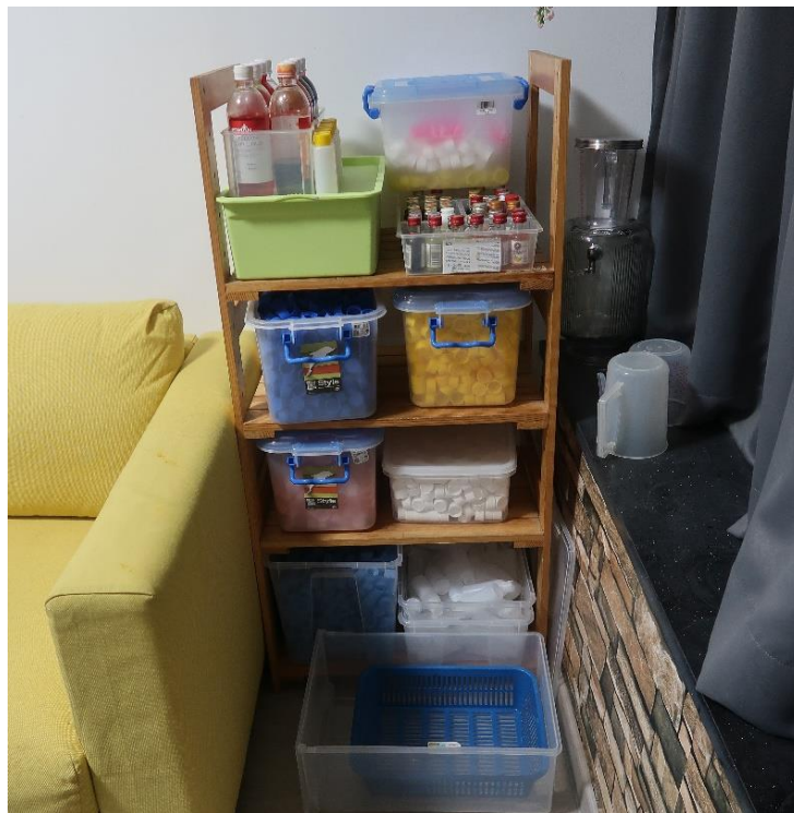
Photos 4 and 5 (HSA): Instruments used to manufacture cough syrup found in an apartment in the vicinity of Beach Road on 1 March 2021.