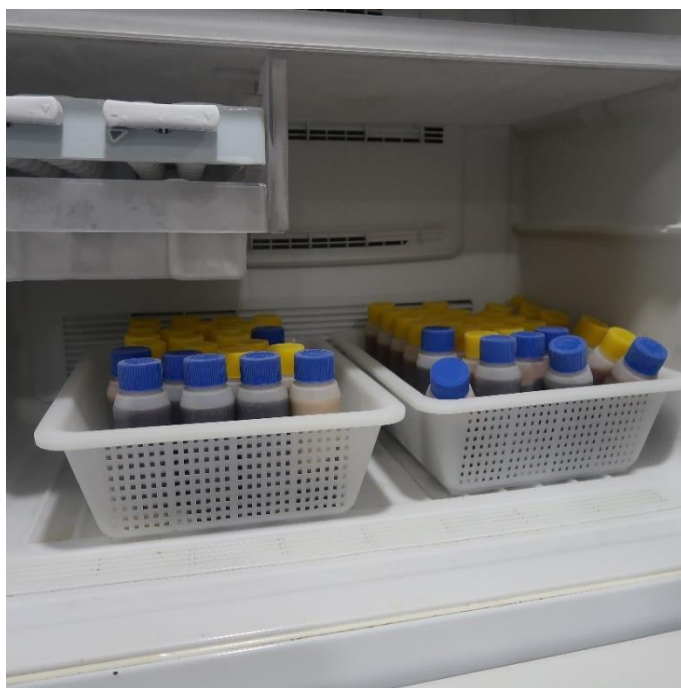
Photo 2 (HSA): Bottles of cough syrup stored in freezer seized from an apartment in the vicinity of Beach Road on 1 March 2021.