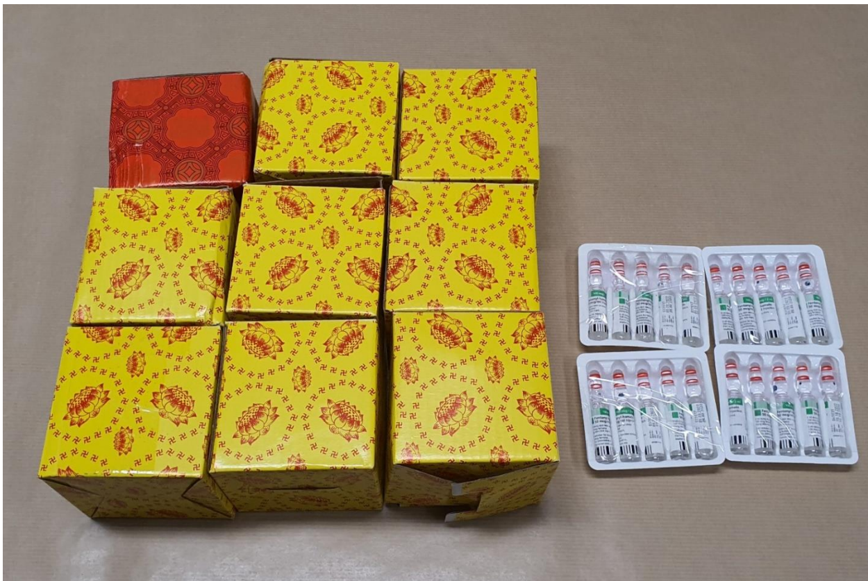
Photo 1 (CNB): 200 vials believed to contain 2ml of fentanyl each, detected in a parcel by ICA officers on 1 March 2021. The parcel was later referred to CNB, who mounted an operation and arrested three suspected drug offenders in relation to the parcel.