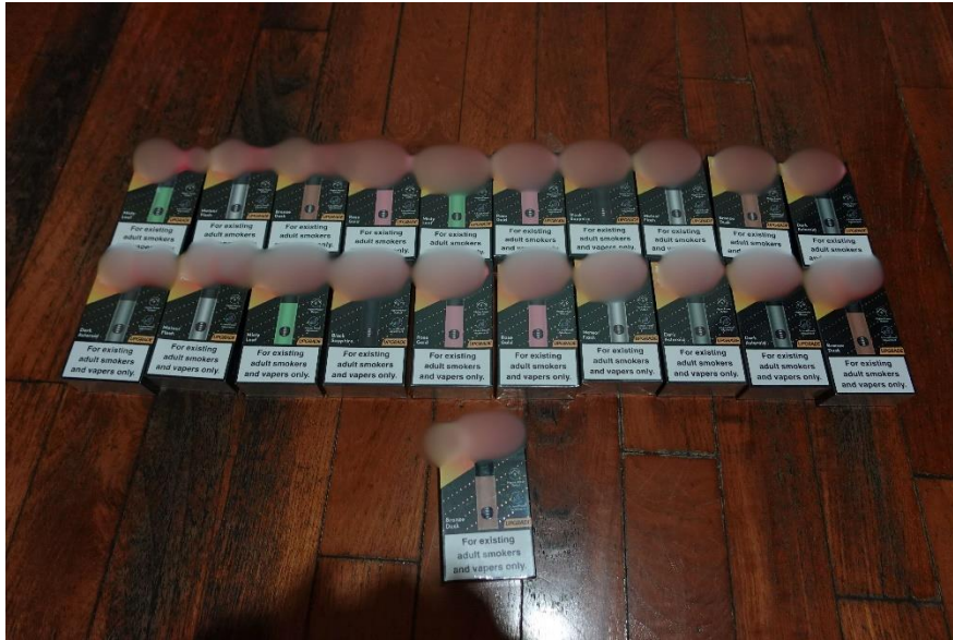
All photos are to be credited to the Health Sciences Authority, Singapore.