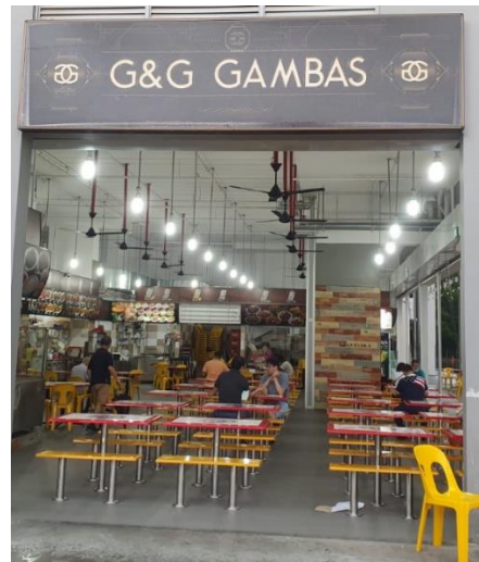
G&G GAMBAS at 50 Gambas Crescent