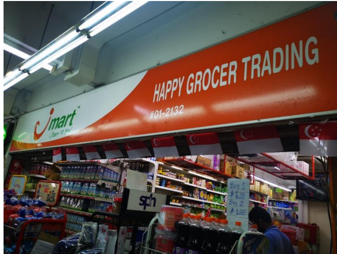
HAPPY GROCER TRADING at 347 Ang Mo Kio Ave 3