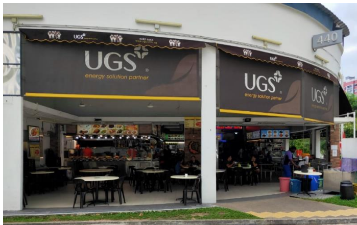
SUPERLUCK FOOD COURT at 440 Bukit Batok West Avenue 8