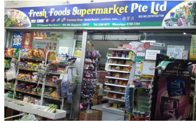
FRESH FOODS SUPERMARKET PTE LTD at 727 Clementi West Street 2