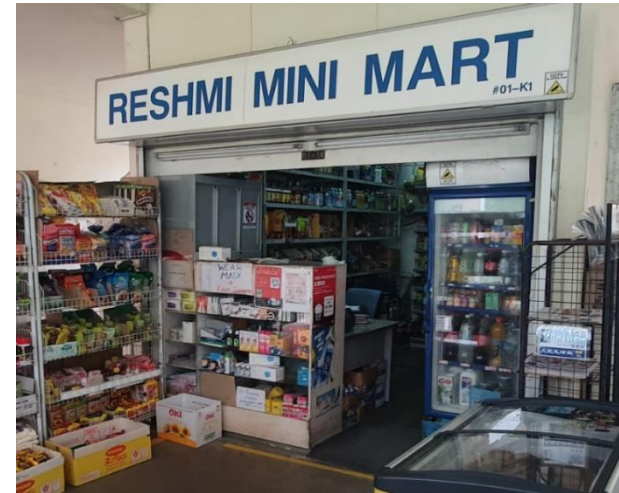
RESHMI MINI MART at 856 Tampines Street 82