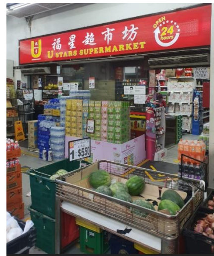
U STARS SUPERMARKET at 261 Punggol Way