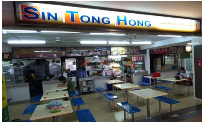
SIN TONG HONG EATING HOUSE at 429A Choa Chu Kang Avenue 4