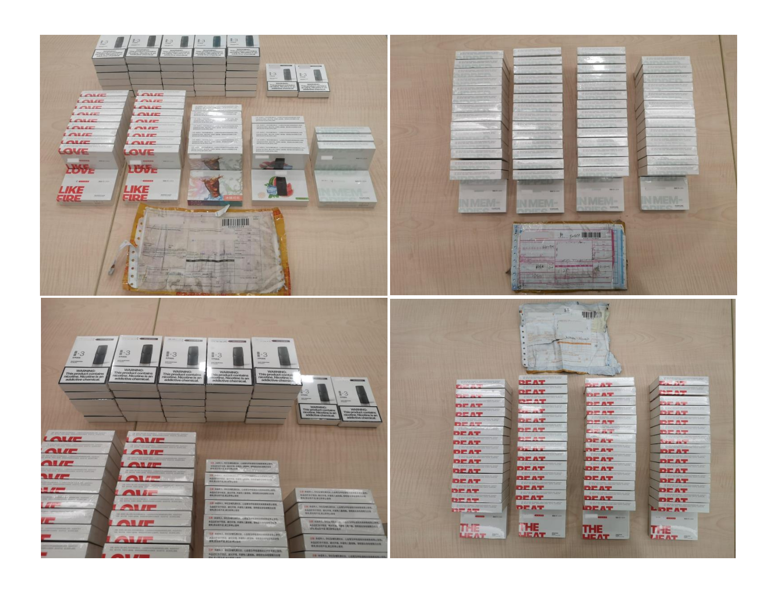
Seized e-vaporisers and e-liquid cartridges from suspect's residence