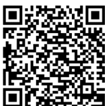
QR code for the application of licence to import controlled drug