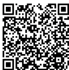
QR code for the Signed Request forms