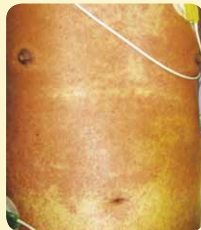
Fig 2: DRESS Confluent erythematous patches and plaques in a patient with DRESS

Clinical presentation 2,7 : DRESS is a complex syndrome commonly characterised by fever, rash, lymphadenopathy, haematological findings (eosinophilia, leucocytosis and/or thrombocytopenia), abnormal liver function tests and renal dysfunction. The cutaneous manifestations typically consist of a morbilliform exanthematous and oedematous rash, with occasional pustules, vesicles and purpura. Hepatitis may be severe and peripheral eosinophilia is usually prominent. The rash and hepatitis may persist for weeks to months after drug withdrawal. Mortality from DRESS is usually due to fulminant hepatitis, hence the importance of recognising this syndrome. Autoimmune sequelae such as autoimmune thyroid disease may develop several months to years after clinical resolution of DRESS. 8