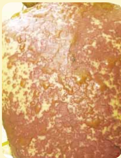
Fig 1: Toxic epidermal necrolysis Discrete and confluent blisters with sheet-like detachment and erosions

Most commonly implicated drugs 3,4 : CBZ, phenytoin, lamotrigine; allopurinol; co-trimoxazole; non-steroidal anti-inflammatory drugs (NSAIDs); nevirapine.