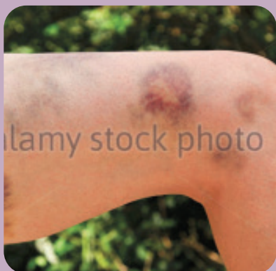
Example of a leg with easy or excessive bruising.

Note: These pictures are only a guide in order to show examples of bruises or petechiae. The patient may have a less severe type of bruise or petechiae than these pictures and still have ITP.