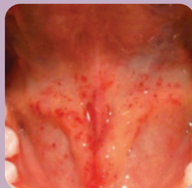
Example of spots due to bleeding under the tongue.

These spots can occur anywhere on your body, not just on your legs.